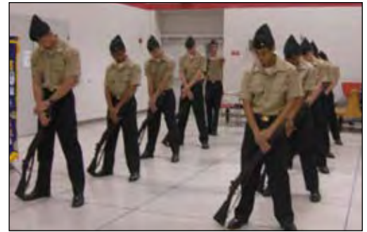
NJROTC Drill Team