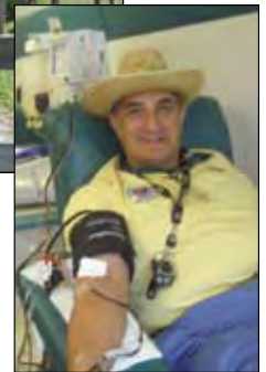
LTG Saied Taie is first to donate blood