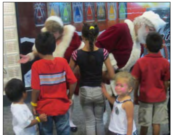
Mr. and Mrs. Claus and the children

I am encouraging other Divisions to start a Christmas in July within their Cities/Counties. The idea was for this to start in Broward County and then grow through the State. The need of these homeless children is great! Thanks for all you do! :)