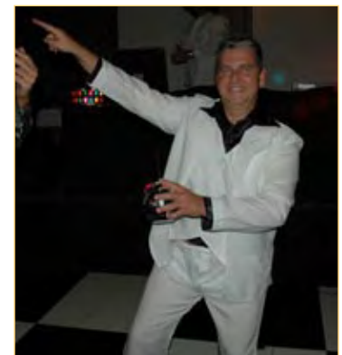
Siesta Key Kiwanis Club President as our event special "John Travolta" from "Saturday Night Fever"!!!