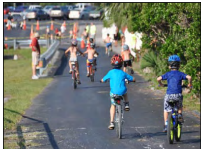
Contestants on the bicycle path.

Childhood obesity in the United States has almost reached endemic proportions. The problem of obesity exists in approximately 17 percent of children and adolescents. Overweight children are more likely to become overweight adults unless they adopt and maintain healthier patterns of eating and exercising. A major concern is that child and adolescent obesity is associated with increased risk of emotional problems. Teens with weight problems tend to have lower self-esteem and be less popular with their peers. Depression, anxiety and obsessive-compulsive disorder are possible consequences of obesity. The Super Kids Triathlon is our contribution in helping children to understand the benefits of exercise, especially employing swimming, bicycling and running to help eliminate obesity.