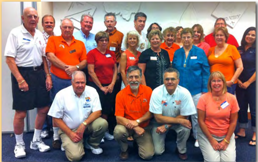
The 2011-2012 Division 19 Kiwanis club officers and leaders join together for day of training.

Visit Kiwanis Club of FMS on the web: http://www.fmskiwanis.com/