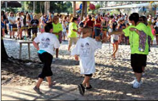
Photo by Ron Kline. Participants at the finish line receiving their medal.

Into the Weeki Wachee Spring's crystal, clear water went the first group, followed closely by the second and then the third. Soaking wet, they emerged from the cold water and ran to their bicycles to race the designated route. After completing this leg of the race they ran (some walked, still fiercely determined to complete the route) to the finish line. It was a wonderful vehicle for the children to exercise. It was the first step to teach children the necessity of keeping in shape to avoid the problems of early obesity.