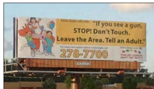
Bill Board located on Colonial Boulevard, East of Metro Parkway

F.L.A.G.S. coaches receive six hours of training and are submit to a background search.