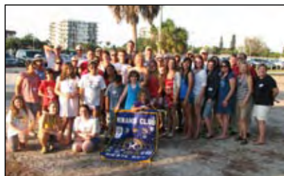
Club Members w/ Pine View Key Club and Brookside Middle Club members and parents

The recognition event was a huge success.