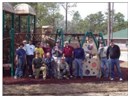
Playground equipment assembled by the Kiwanis Club of Niceville – Valparaiso

In the center of the neighborhood is a safe, modern playground, assembled by the Kiwanis Club of Niceville Valparaiso. Kiwanians contributed 400 service-hours to the assembly of the playground equipment, thus saving the CIC approximately $12,000. The Club has also committed to share weekly grounds maintenance with other local service