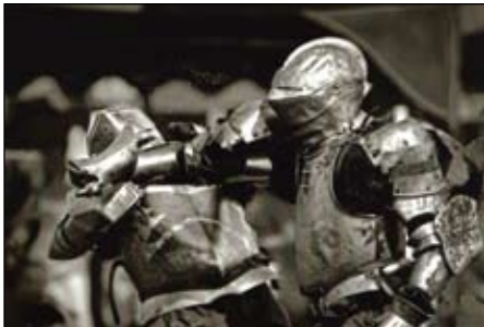
Two knights competing in performance combat.

All profits from the Medieval Faire go to the Kiwanis of Riverdale Foundation Fund to support such programs as thanksgiving baskets for the needy, Christmas dinners, Buckingham Exception School, Orange River Elementary, Sunshine Elementary, school grants and scholarships.