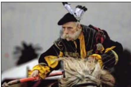
An actor performs in medieval costume.