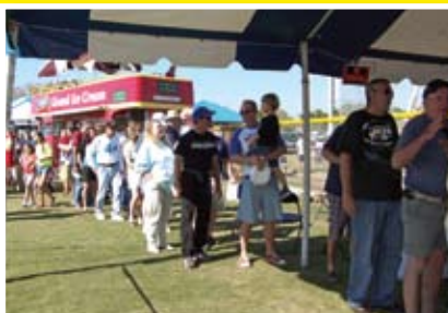
Kiwanis Taste of Pine Island 2009 crowds form to judge in the Southwest Florida Chowder Cook-off Contest.