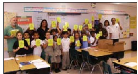
Lake Worth Kiwanis with 3rd graders on Dictionary Day.