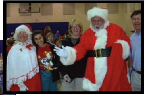
Santa & Mrs. Claus with students - Kiwanis Holiday Party